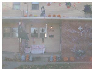
Second place tied with